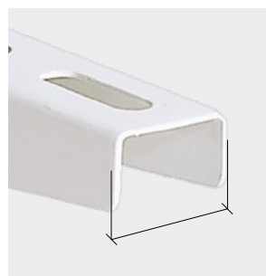
M 50/60 mm 250 kg