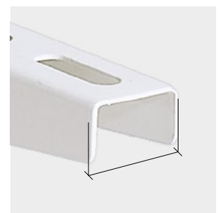
E 80 mm 350 kg